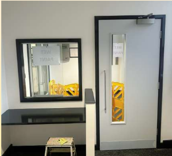
Installation of new Entrance Sports Centre, Northumberland