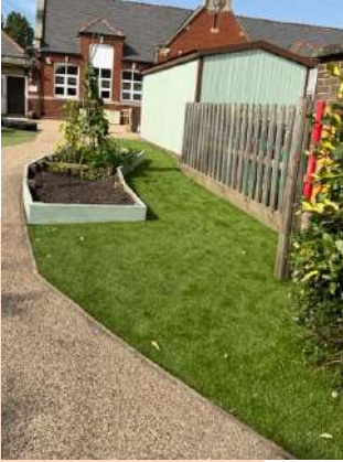
Artificial Turf Installation Primary School, Gateshead