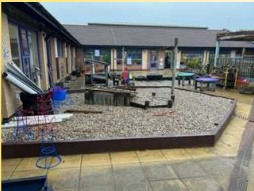
Creation of Pebble Pool Primary School, Newcastle