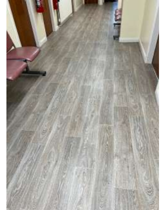
New Flooring Dr Surgery, Chester le Street