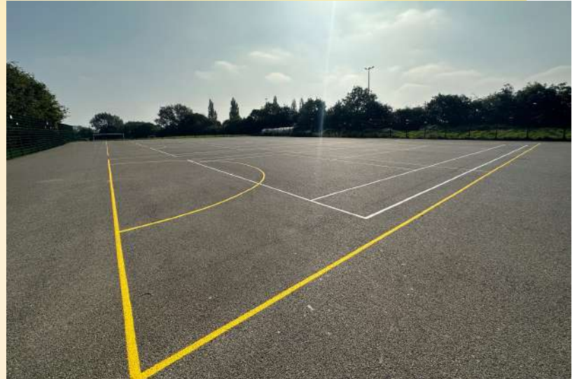
Line Markings Secondary School, Darlington