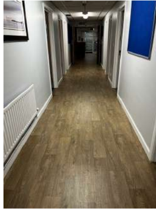
New Flooring Dr Surgery, Newcastle