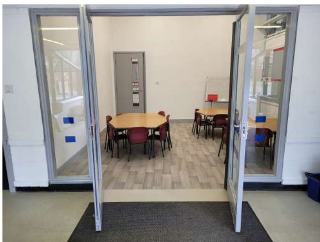
Internal Classroom Creation & New flooring Secondary School, Newcastle