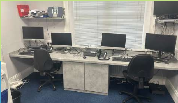
Bespoke desks created in Doctors Surgery