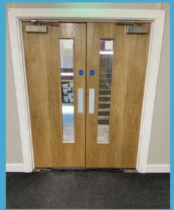
New fire doors added throughout High School