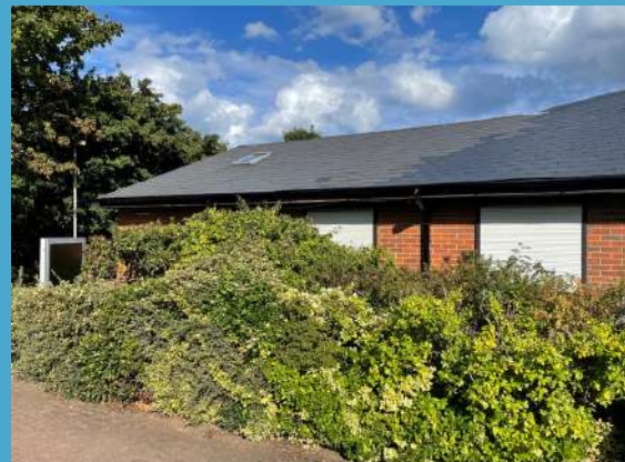
New guttering installed at a school.