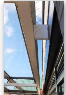
Installation of Pigeon Spikes