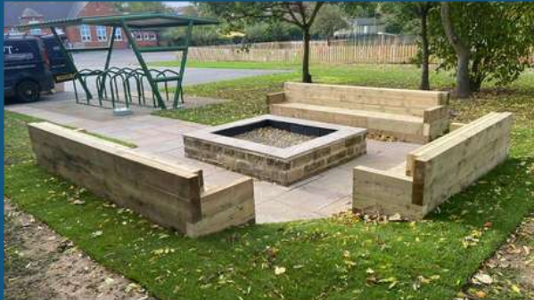
Fire Pit & Seating