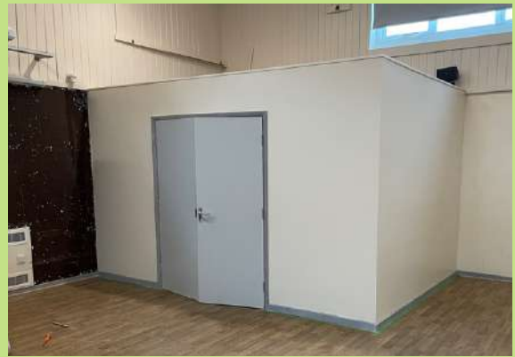
New storage section created in a primary school hall