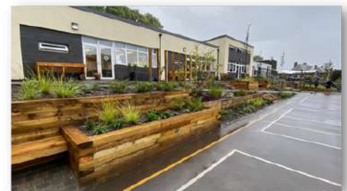
Landscaping & Play Area