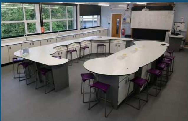
Science Lab Relocation & Refurb