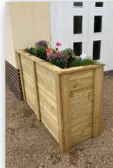
Creation of Raised Planters